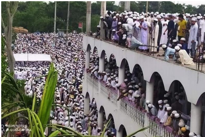
A funeral procession in Brahmanbaria

Many of our respondents from rural/semi-rural areas confirmed transfer for “stigma power” into the hands of the micro-community. This has also been viewed in a way to escape “social distancing”, because if the community can prevent outsiders, they can lead their “normal” lives. This thought led them to become more watchful and aggressive about receiving outsiders into the community.