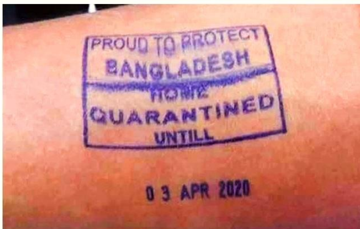
The seal of quarantine