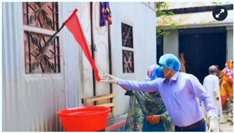
Flagging a migrant's house

hardly followed any self-isolation directives. Necessarily, fear and anger were generated within the community against these migrants. At this point, local government authorities put red flags in the migrant returnees' houses. This was the official endorsement of othering the migrant returnees as deviants which in other words was the beginning of formal stigmatization of a particular group of people.