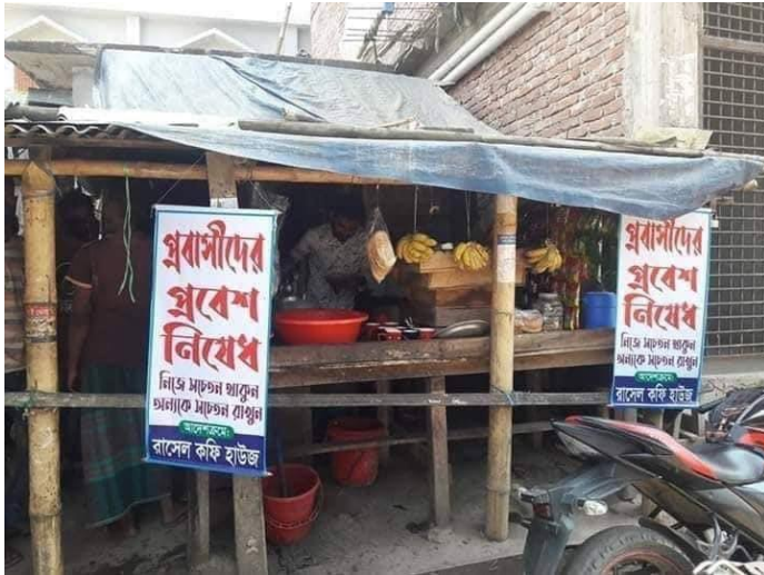
The stigma in operation