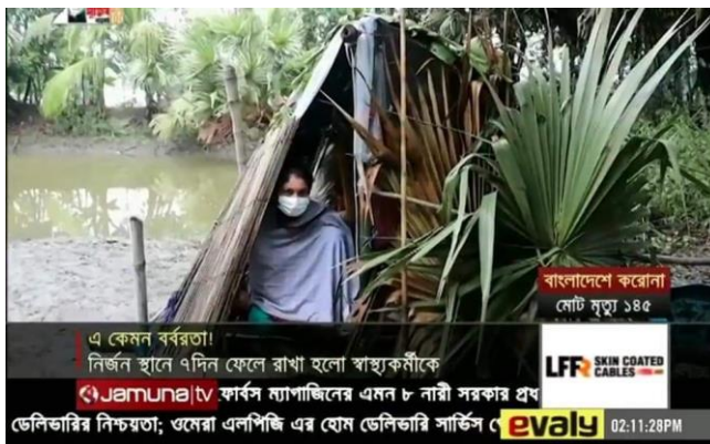
A health worker deserted in her own village

Phase of mistrust: On 5 April, Bangladesh reported 18 new cases, representing a 26% increase on the previous day. From then till the present day, the day-on-day increases have exceeded 20%, representing a steep rise in cases. Bangladesh crossed the figure of 100 confirmed cases on 6 April and 1,000 confirmed cases on 14 April. Bangladesh has extended a nationwide lockdown till May 5 as part of measures to stem the spread of coronavirus pandemic. Meanwhile people were further confused with excessive and conflicting information (info-demic). Reports of mismanagement of cases in the dedicated corona hospital at Kurmitola, lack of PPE for the health providers, the closing of private hospitals, all of these generated an atmosphere of deep mistrust on the health system in the country.